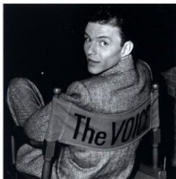
THE VOICE. c.1940. Before Frank Sinatra's face was known across the country, he was simply, as his chair advertises, "The Voice."

includes some fine photography, an excellent CD and numerous artifacts. These mementos augment different phases of Sinatra's life along with plentiful quotes and anecdotes from many who knew him and worked with him over the years. The author states in his introduction that, but for space limitations, the book might have weighed a thousand pounds. Such is the extent of available material in the family's possession. This trend of including removable bits and pieces of memorabilia and souvenirs from a subject's life is gaining momentum in the world of publishing. It's not without appeal, if done well. A fine example is a book that came out last year on John Lennon, and is one of the precious few instances in which his widow, Yoko Ono, has shown some integrity.